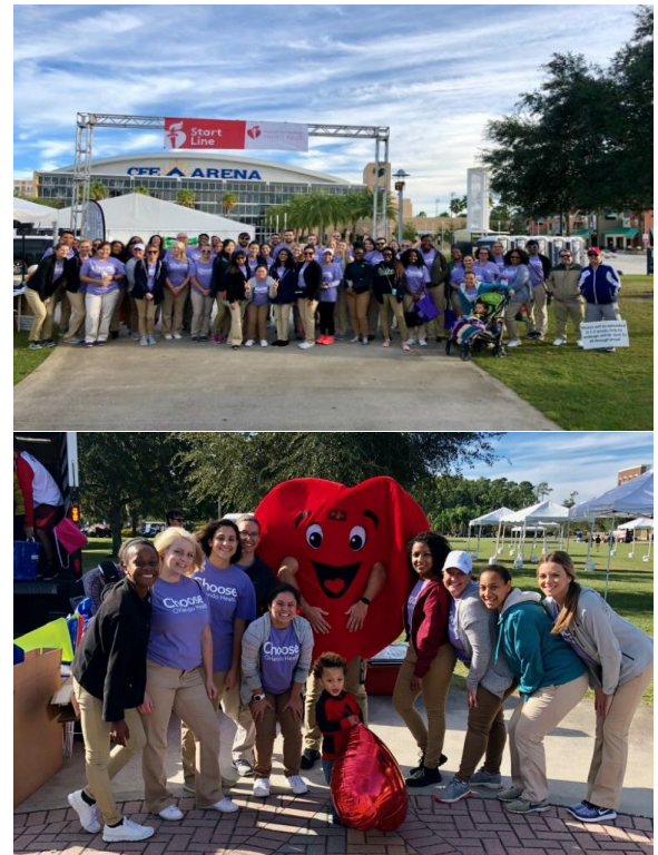
Thank you to everyone who made it out to the Heart Walk on November 3<sup>rd</sup> with Orlando Health! It was a huge success!